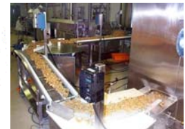
Food Grade Approved – meets H1 specifications for incidental contact.