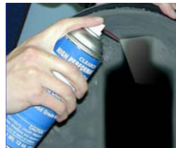
Provides multi-part releases per application.