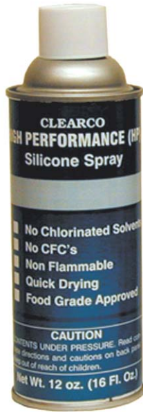
12oz.net wt. (16oz can size)

High Performance Silicone Spray is used in many areas to prevent sticking and allow materials to slide more easily. High Performance is used by Injection Molders as a Release Agent for Plastics and other materials. Its Super Fast Drying System provides excellent coverage on the entire mold, allowing for easy release of formed parts. High Performance Silicone Spray is Non-Flammable aerosol and Does Not contain CFC's or any Class I or II Ozone Depleting Chemicals.